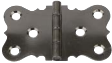
Table hinge, 38 x 65 x 1 mm