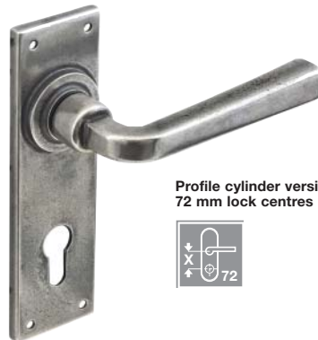
Profile cylinder version 72 mm lock centres