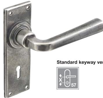
Standard keyway version