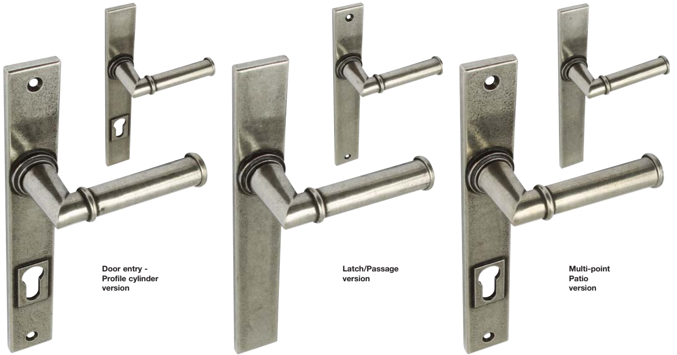
Door entry - Profile cylinder version