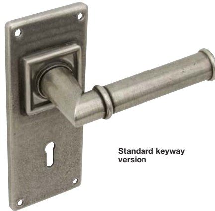
Standard keyway version