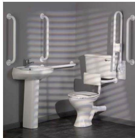
Note: Sanitary ware i.e. sink and toilet are not included

Discontinued 980.39.107 - No longer available 980.39.108 - No longer available 980.39.117 - No longer available 980.39.118 - No longer available